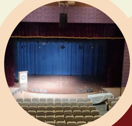
GNVS Wellness centre